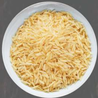
Sella 1121 XXXL